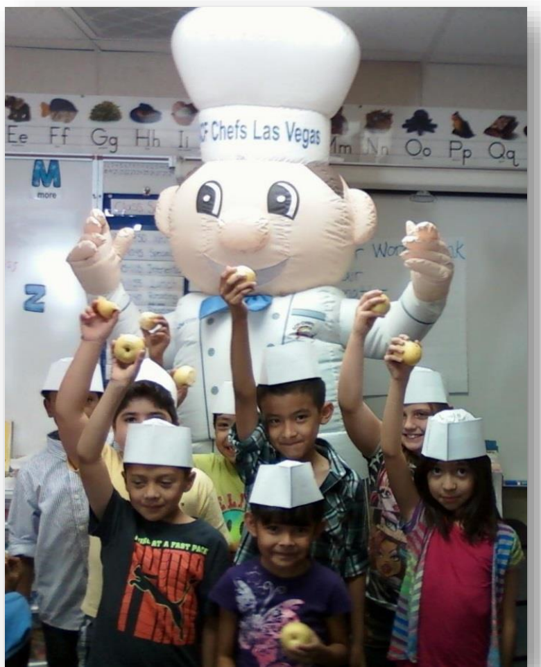
The Chefs for Kids Foundation helps brings nutrition education to CCSD schools.

academic achievement, lower healthcare costs, improve workforce productivity, & improve military readiness.