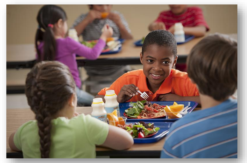
All students deserve the opportunity to be healthy and successful.