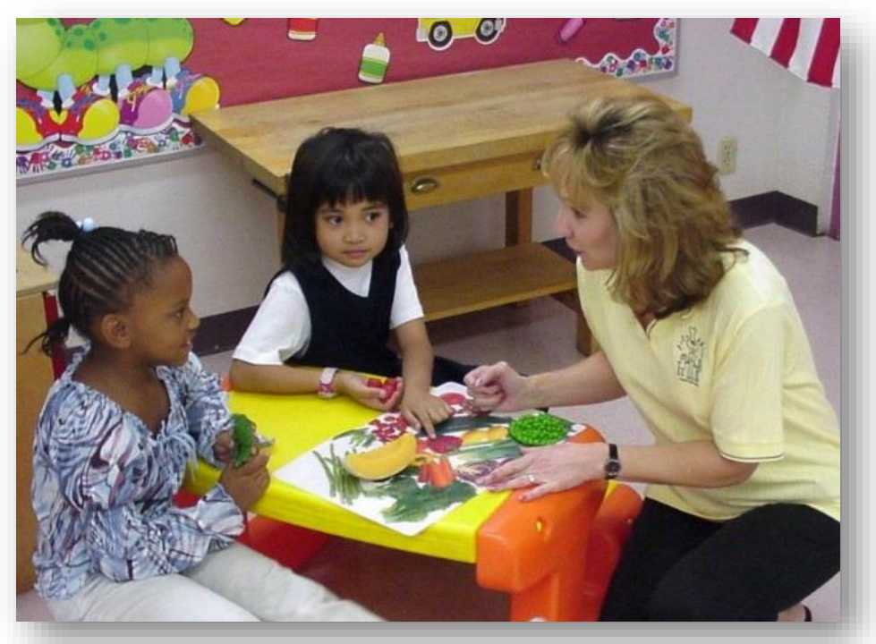
An Extension instructor teaches children about fruits and vegetables.

Other school-based activities that promote student wellness