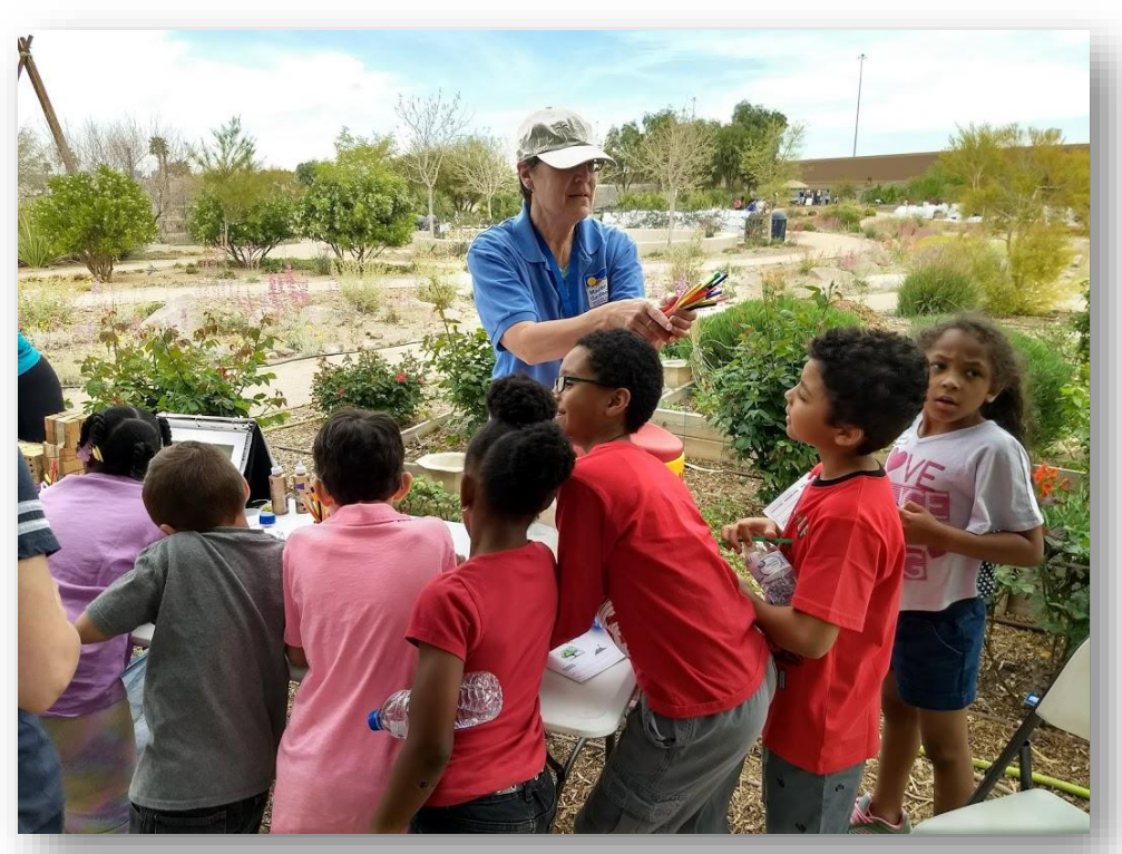
Extension horticulture staff teach about growing food during educational field trip at UNCE Botanical Gardens.

Assess lessons against states/districts educational goals and curriculum standards.