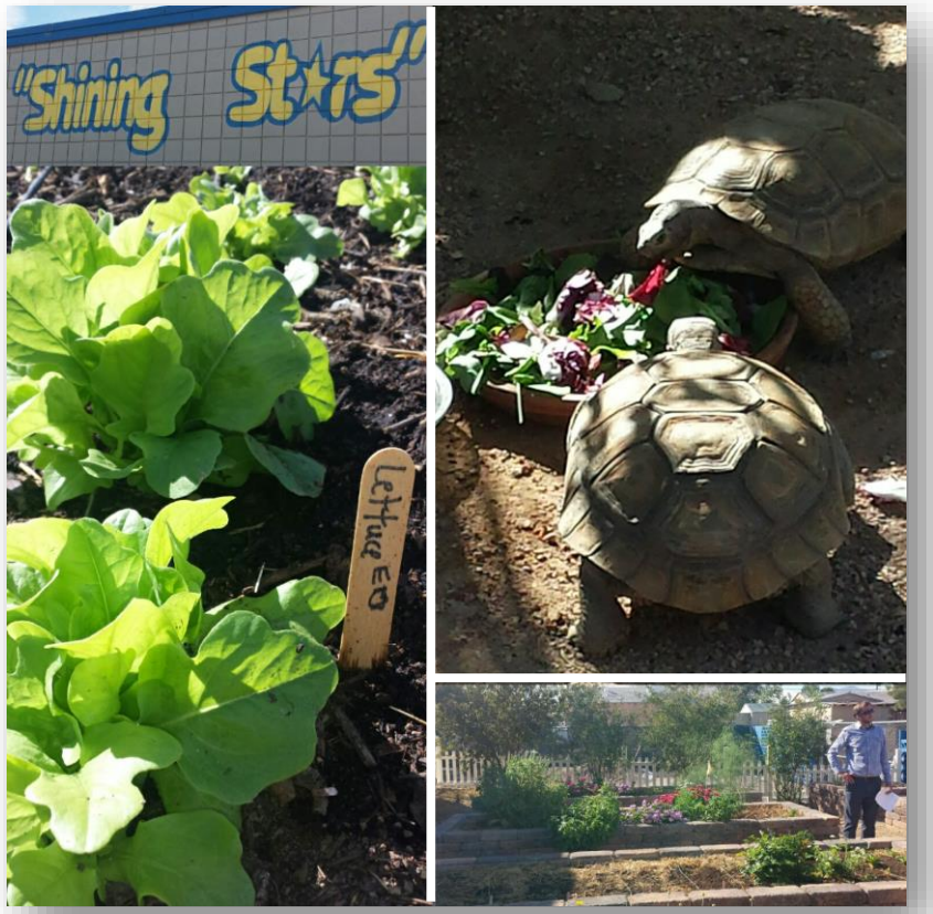
CCSD has the largest school garden program in the nation.