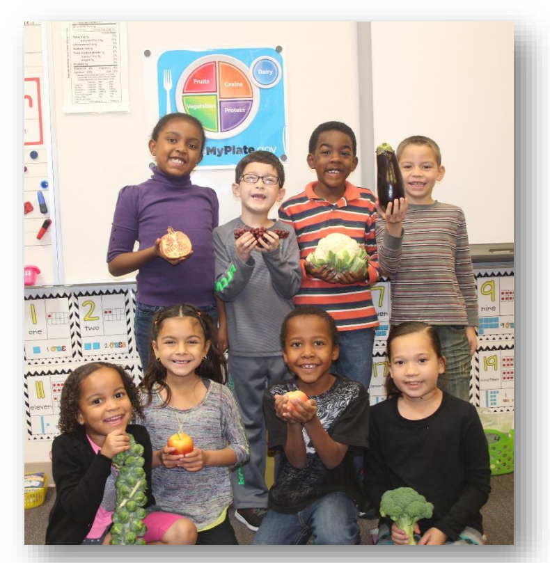
Second graders participating in Pick a Better Snack lessons.