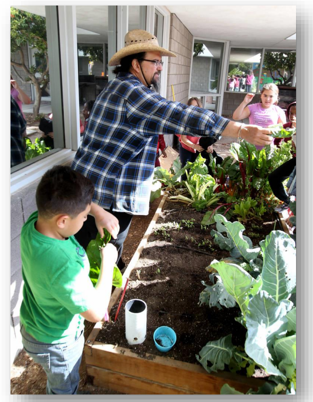
Garden Farms also helps maintain school gardens.