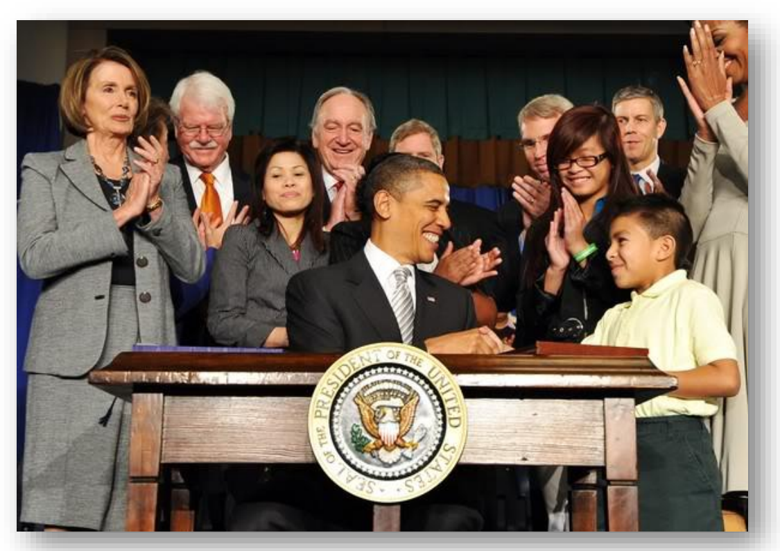
School Wellness Policy was strengthened by the Healthy, Hunger-Free Kids Act of 2010.