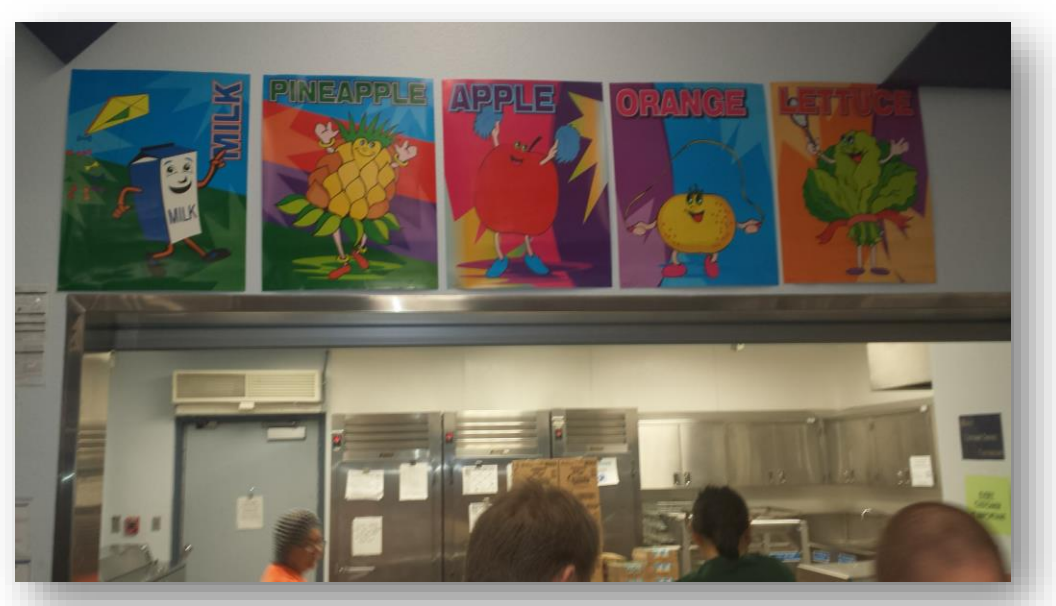
Posters are an easy way to help reinforce nutrition education.