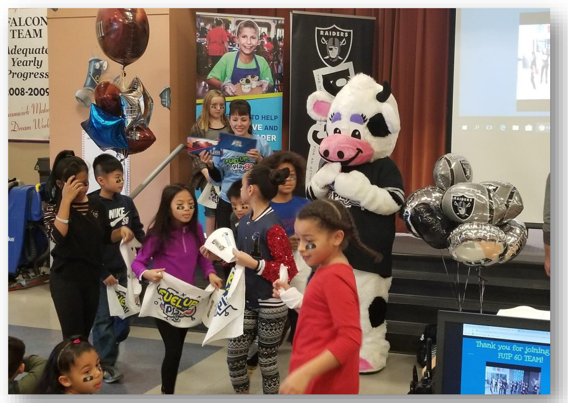
Fuel Up To Play 60, a Dairy Council initiative, gives a lucky teacher tickets to the Super Bowl at Forbuss E.S.